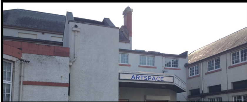
This is the main entrance from outside