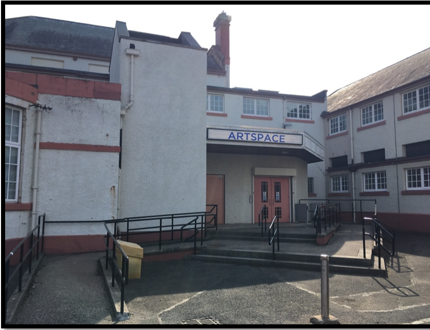
This is the main entrance from outside