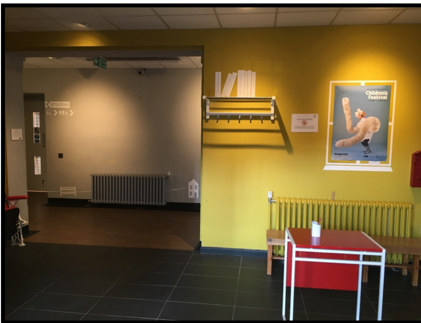
This is the Box Office area, where you will collect your tickets and your sensory resources if you would like them.

Sensory resources include fidget toys and ear defenders.